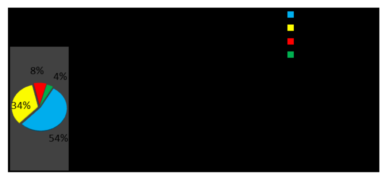
Figure 1.Percentage distribution of age of staff nurse.

Among the selected staff nurses for 50 samples, most of the staff nurses that is 27 (54%) were in age group 20-25, 17 (34%) are belonging to the age group of 25-30, about 4 (8%) were of 30-35 group and 2 (4%) were above 35. Maximum 80% of the population were females and 20% were males. While assessing the religious factor, about 29 (58%) were Hindu, 19 (38%) were Christian and remaining 2 (4%) were Muslims. Education status is clear through the data that 24 of the staff nurse (48%) were perceived ANR and GNM nursing, 14 (28%) were of PBBS nursing and remaining, 12 (24%) were BSc nursing. While assessing the years of experience, 22 staff nurses (44%) were of 1-3 years, 23 staff nurse (46%) were 4-6 years and about 4 (8%) was of 7-10 years of experience (Figure 1).